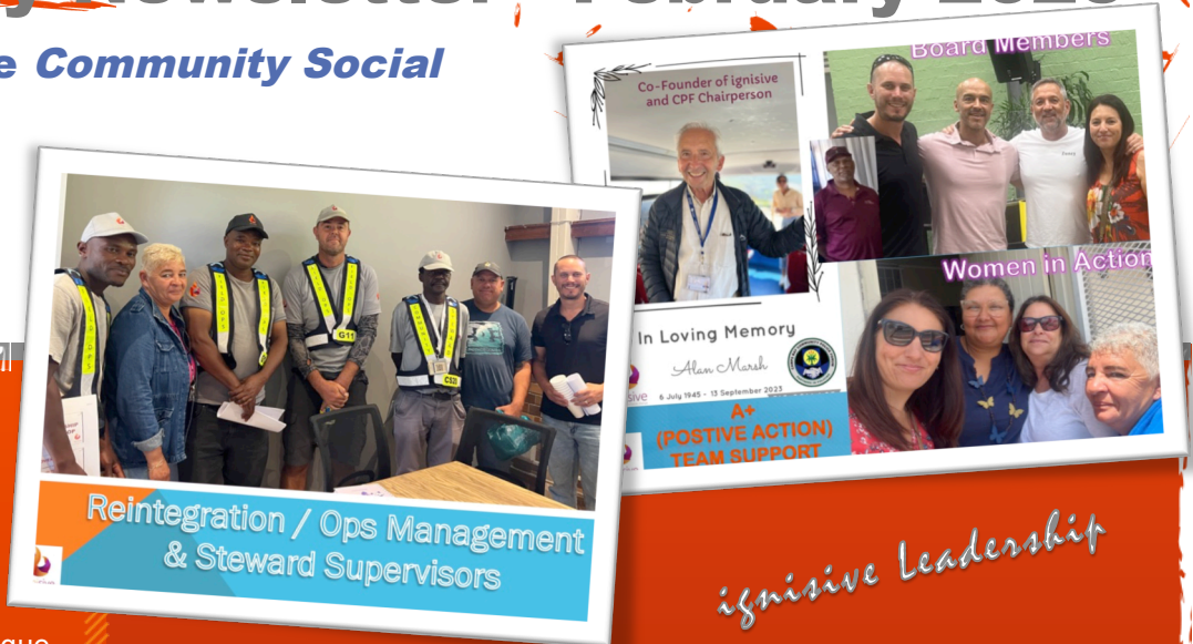
Reintegration / Ops Management & Steward Supervisors