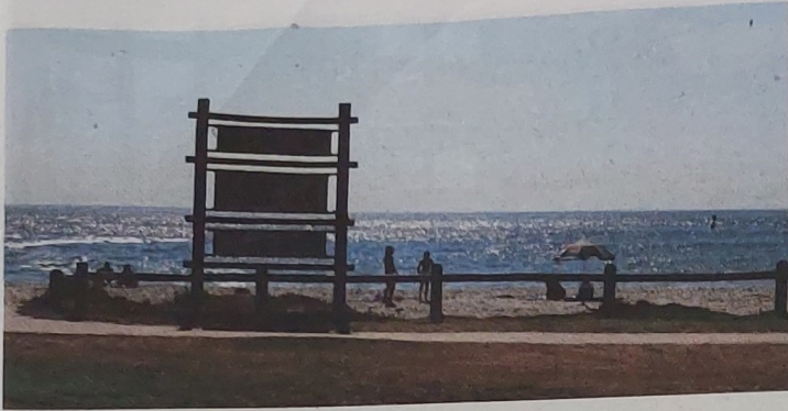
■ Camps Bay Beach is one of eight Cape Town beaches awarded Blue Flag status by the Wildlife and Environment Society of South Africa.